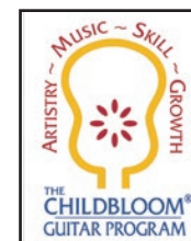
Bella Corda USA