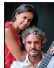
Duo Melis Spain and Greece