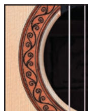
G. I. Guitar Exhibit USA