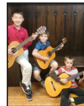
Suzuki Ensemble USA