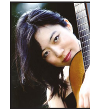
Xuefei Yang China