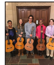
Childbloom Ensemble USA

Presented at the Cleveland Institute of Music in cooperation with GUITARS INTERNATIONAL