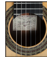
G. I. Guitar Exhibit USA