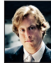
Jason Vieaux USA